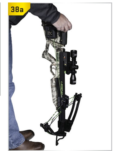
Engage the ACUdraw safety pawl, insert the crank and begin cranking.