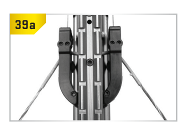
Notice that the string is under heavy tension once the bow is cocked.