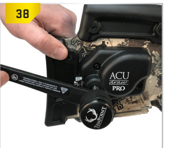
Insert the ACUtorq and begin cranking.

4. Engage the safety pawl and re-insert the ACUtorq handle or the crank in the drive hex (photo 38 or 38a). NOTE: The safety pawl will automatically engage on the ACUdraw PRO as you begin to crank the device.