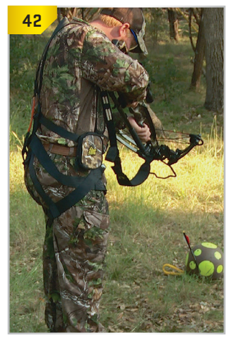
Special purpose unloading target.

Make sure that your crossbow hunt follows the laws of the location in which you are hunting. Some jurisdictions require that a crossbow be un-cocked and/or encased during transport.